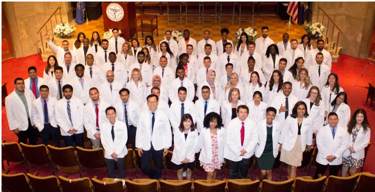
The annual White Coat Ceremony symbolizes lifelong commitment to serving the health care needs of patients.